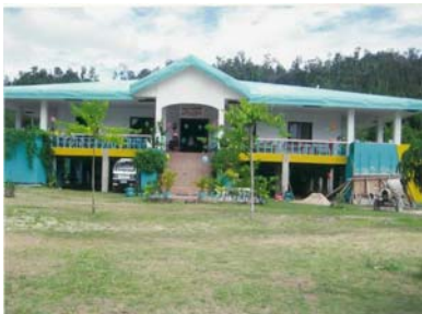
View of beach from ocean