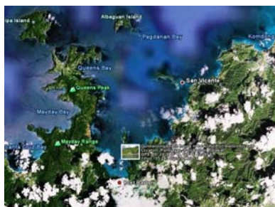
View of satellite area map