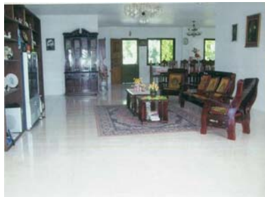
View of right side beach