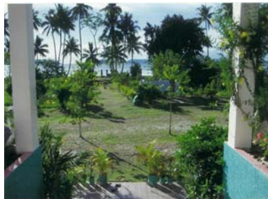
View of ocean from beach