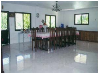
View of left side beach