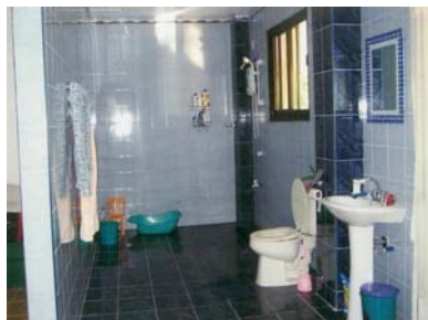
View of coral dip pool