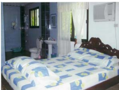
View of beach interior