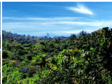
View of tropical forestation