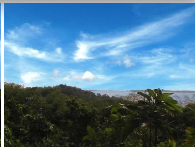
View of Stanlake Island