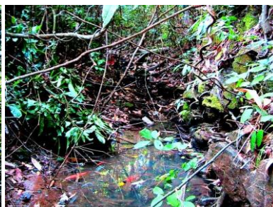
View of water source