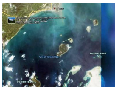
View of satellite area map