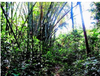
View of natural bamboo