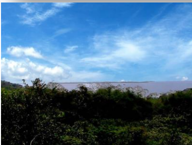
View of Stanlake Island