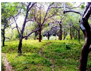
View of property surroundings