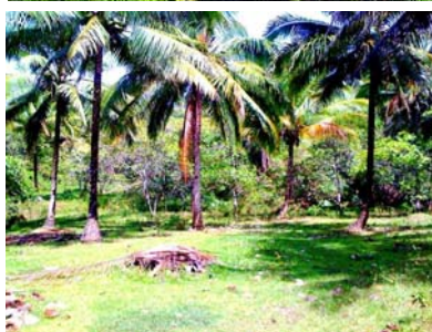
View of tropical forestation