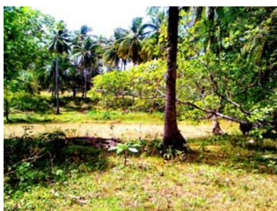
View of property surroundings