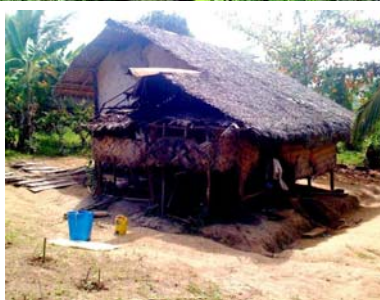
View of existing structure