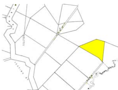
View of property tax map