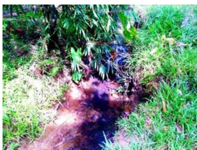
View of the water supply